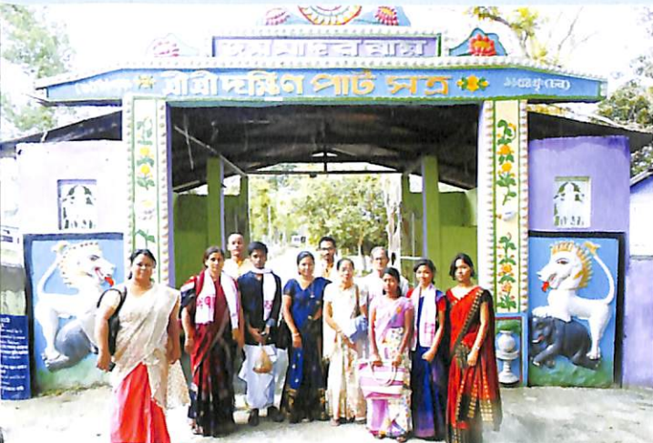
Project tour to Majuli, Dept. Geography