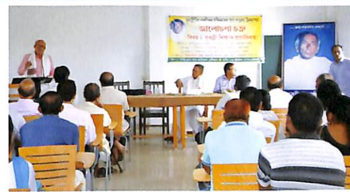
Seminar on History