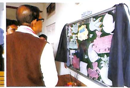
Inauguration Wall Magazine, Dept. Economics