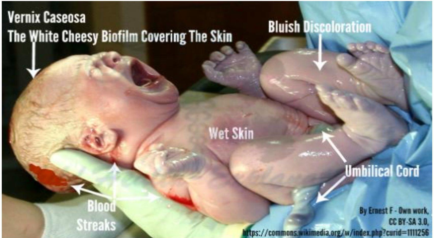
Neonates Just after the Birth